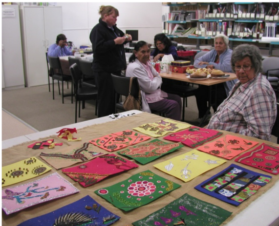
During the period DEG held a short program of women's healing workshops aided financially by Interrelate.