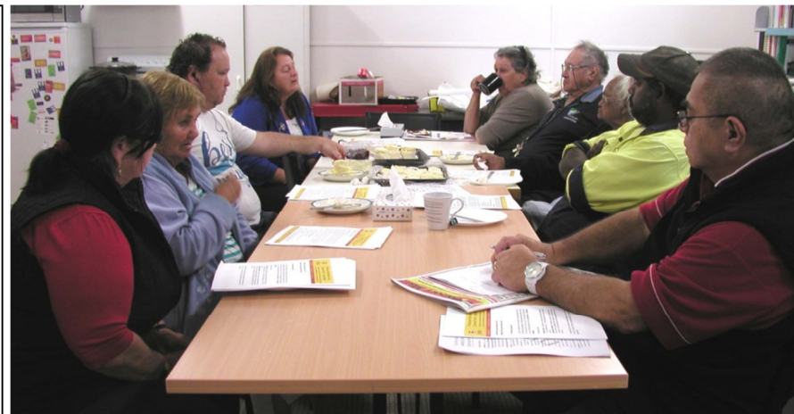
Left: In September 2013 DEG hosted a community focus group to discuss preliminary findings for 'Indigenous Australians with Mental Health Disorders and Cognitive Disabilities in the Criminal Justice System' research conducted by the Uni of NSW.