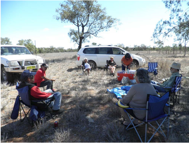
Lunch at Llanillo during an Aboriginal cultural heritage training survey conducted September 2013.