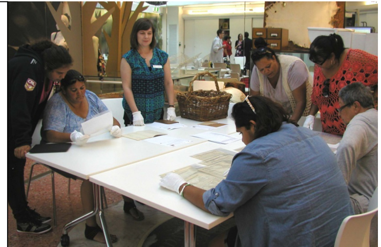
Above: NSW State Library Indigenous Unit introduced the group to its resources relevant to Walgett's identity