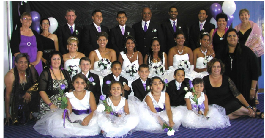
Heuristic Video produced a DVD of the 30 November 2013 White Ribbon Debutante's Ball. DEG sold copies to attempt cost recovery. Costs were not fully recovered as no debutantes bought copies from DEG after copies were purchased by the organisers!