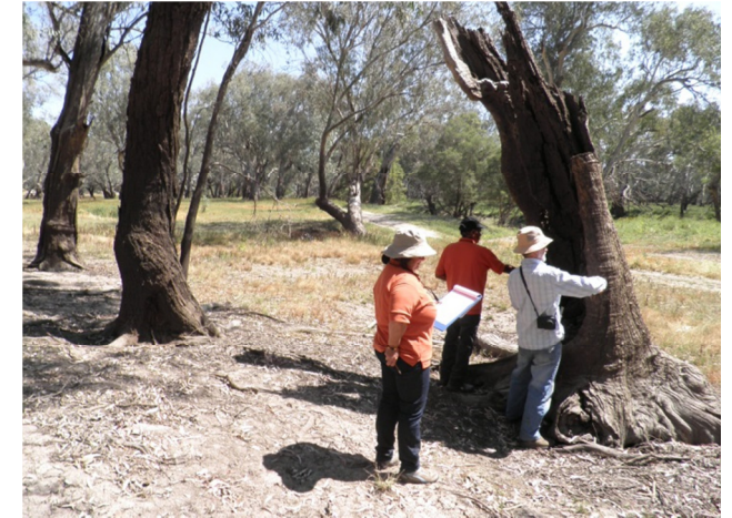
Staff learning survey techniques from Peter Thompson at a scarred tree. September 2013.