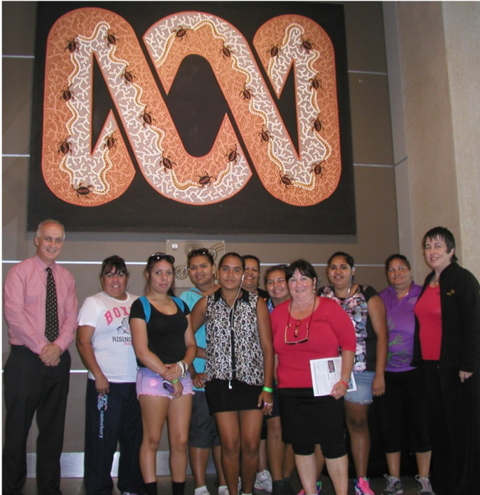
Left: Part of the Old People Teach Families Project included a journey by some participants to Sydney cultural institutions, learning about employment and lifelong learning opportunities. They were welcomed by the ABC and toured the Ultimo Centre.