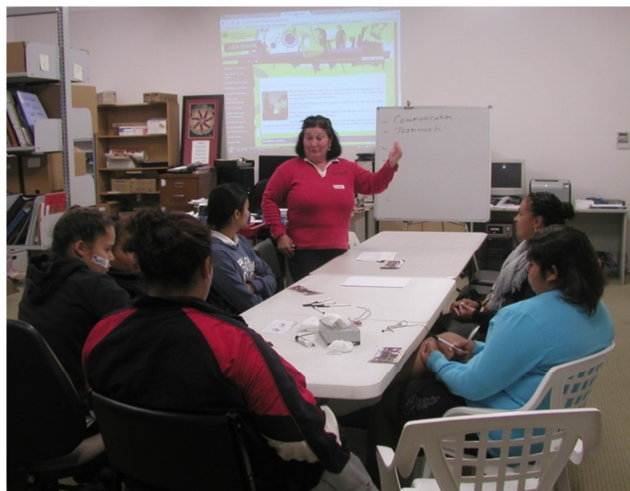
Left: a scene from an Elders Teach Family project workshop in July 2013. Right: Elders Teach Family project graduation ceremony held August 2013.