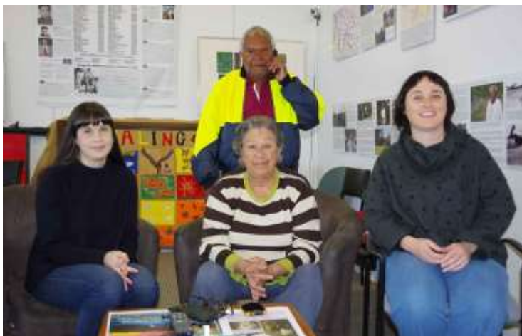
Above: Mangungaali ( Varanus Varius ) at BarwonWeir December 2017. Above right and far left: Episodes of our Elders Knowledge Sharing program May 2018. This program has been important to develop future knowledge-holders and workers for culture-led wellbeing community programs we hope will be delivered in Walgett when wellbeing is invested in.