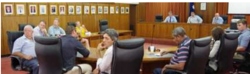
Above: Then NSW Water Minister Niall Blair and previous NSW Water Minister and Barwon MP Kevin Humphries faced the music in Walgett in February 2019 before the March NSW election.